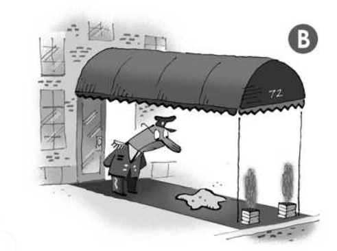
CARTOONS BY BOB STAAKE FOR THE WASHINGTON POST

As we insist on doing year after year, we put up some inscrutable Bob Staake cartoons and asked for captions. The Empress received more than 1,300 entries, as many as 400 for a single cartoon. See the cartoons in color at wapo.st/invite1468.